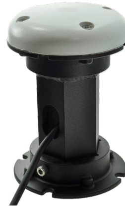
Antenna shown with optional bracket. Bracket allows for mounting on single center 5/8 bolt or four perimeter bolts.

Dimensions ..... 8.9 cm diameter, 2.1 cm height (3.5" diameter, 0.84" height) Weight ..... 0.200 Kg (0.44 lb) Operating Temperature ... -55 °C to +85 °C (-67 °F to +185 °F) Altitude ..... ≤ 16,764 m (55,000 ft) Finish ..... UV resistant, high impact thermoplastic white aluminum base Compliance ..... ROHS Frequencies ..... 1551-1615 MHz Signal gain ..... 43 dB Voltage ..... 4.5 V DC to 18 V DC Polarization ..... Right Hand Circular Axial Ratio ..... 3 dB Max @ boresight Amplifier Noise Figure ..... 2.5 dB Max Impedance ..... 50 Ohms VSWR: ≤ 2.0:1